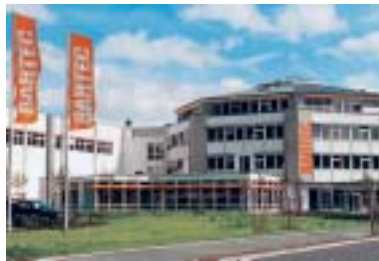
Headquarters in Bad Mergentheim

With more than 20 sales units and over 30 representations, we are always only a few steps from our customers: Thus, we are immediately on the spot, are able to directly communicate with our customers and develop solutions.